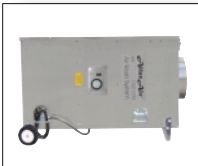
AllerAir Model AR 3000 Hood Vertical

AR 3000 Hood Can be used horizontally or vertically with interchangeable outlets.